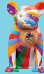
RADIANT HEART BEAT OF THE COAST